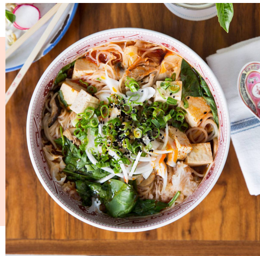
Good luck trying to finish a bowl yourself.