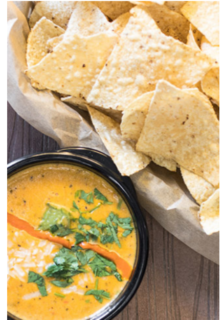
Come on, look at this queso!

Pinthouse Pizza - Super tasty pizza combinations, a great selection of their own beers on tap, and their homemade ranch is killer! We love the Honey Pear Pizza (we sub the blue cheese for goat cheese) - in the Brodie Oaks Plaza